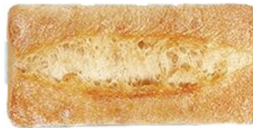
Ciabatta Allegro Sandwich Roll