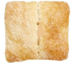
Artisan Square Burger Roll (Sliced)