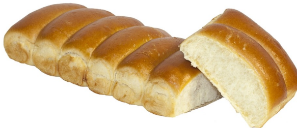
Fireking Brioche Lobster Rolls