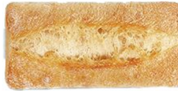
Ciabatta Allegro Sandwich Roll